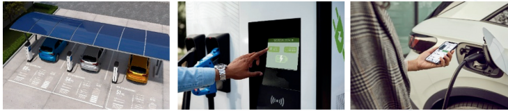
Types of charge stations

We partnered with a German-based automotive giant to develop a white-labelled mobile app for OEMs entering the EV market. This app empowers EV drivers to: